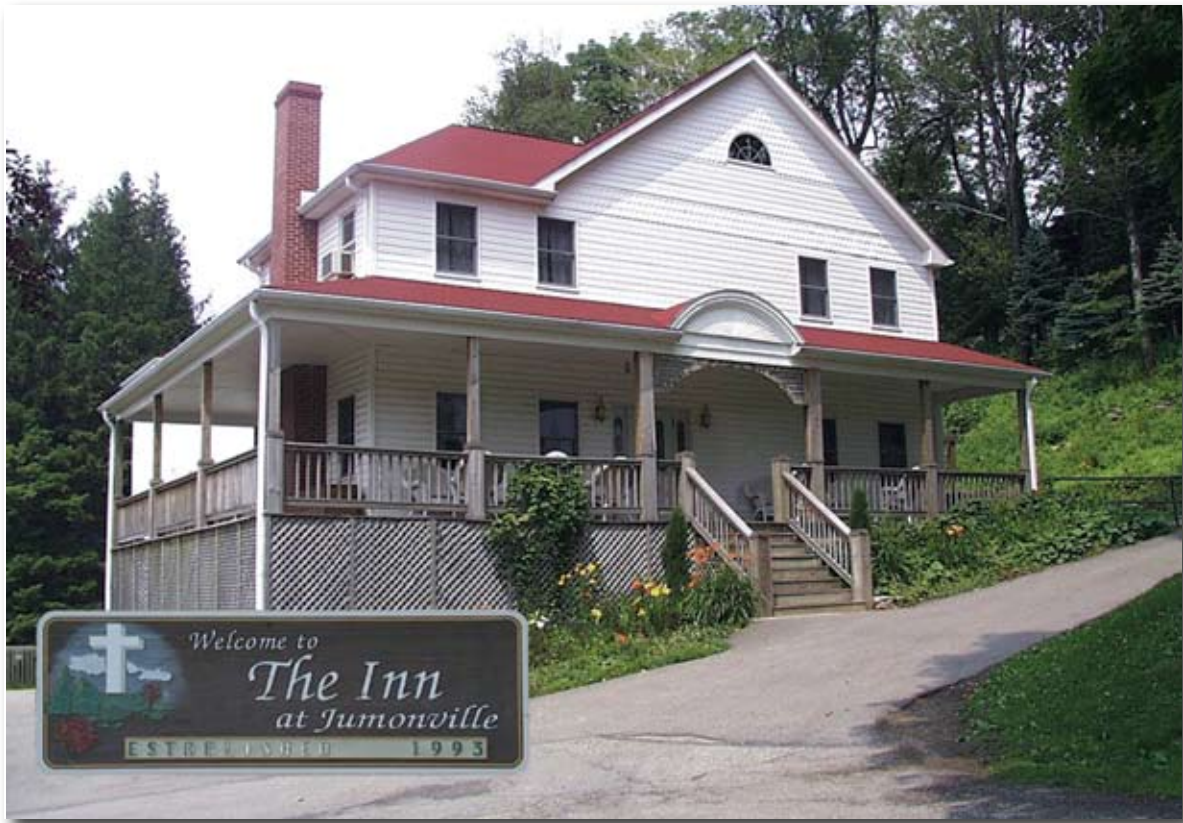
The Inn at Jumonville